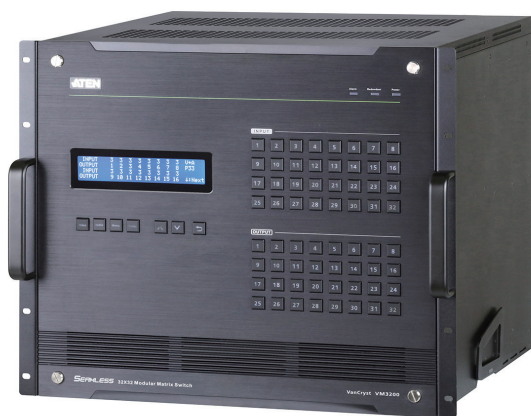
VM3200 Front view