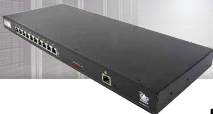
19 inch rack mountable KVM switch, DVI, DisplayPort, USB and audio