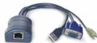
Example CAM: CATX-USB-A

CAM: Computer Access Module PS/2 only: CATX-PS2 PS/2 plus audio: CATX-PS2-A USB only: CATX-USB USB plus audio: CATX-USB-A Sun plus audio: CATX-SUNA Single Rack Kit: RMK-ALIP Dual Rack Kit: RMK-ALIP-Dual Serial upgrade cable: CAB-9M/9F-2M Slave power switch for connection to AdderView CATxIP 1000 or master power switch: PSU-8SLAVE Master power switch for connection to AdderView CATxIP 1000 or standalone Ethernet operation: PSU-8MASTER