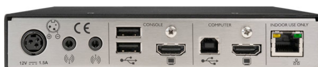
ADDERLink XDIP - Rear