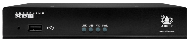
ADDERLink XDIP - Front