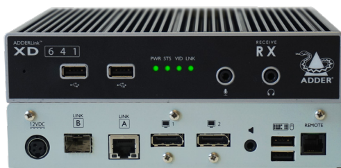
ADDERLink XD641 RX - Front & Rear

CAT6 is recommended for CATx extensions. CATx extensions are limited to 2 patch connections. Patch cables should be CAT6 or better.