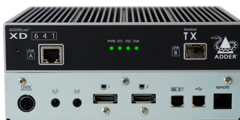
ADDERLink XD641 TX - Front & Rear