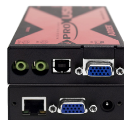
ADDERLink X-USB PRO - Local