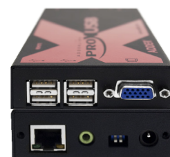
ADDERLink X-USB PRO - Remote