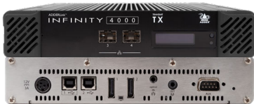
ALIF4001 TX - Front & Rear