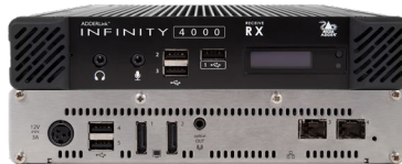
ALIF4001 RX - Front & Rear