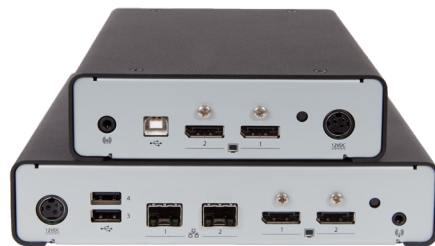
ADDERLink INFINITY 2122 TX & RX - Rear